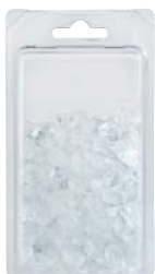
POLYPHOSPHATE CRYSTALS 6/10 (small) 160 g blister, refill TO DOSAL.